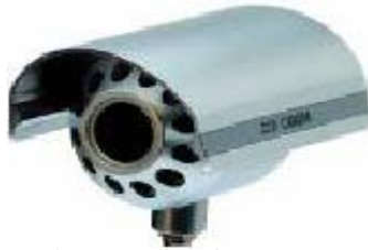
BCN-4039W/H: B/W Night Vision up 50ft Bullet Camera, Waterproof, 12 x LED, 0.01 Lux, 400 TV Lines, 3.6mm