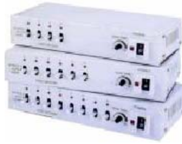
SW-404: 4 CH. Switcher, BNC - RCA SW-404A: 4 CH Switcher, BNC-RCA w/Audio