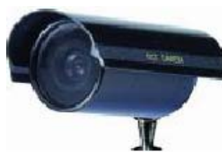
BCN-4049WH: B/W Night Vision up 50ft Bullet Camera, Waterproof, 12 x LED, 0.01 Lux, 400 TV Lines, 3.6mm