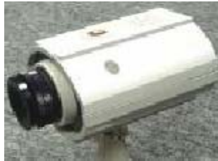
BO-2260: B/W Obs. Camera, 0.1 lux, 400 TV lines, 4mm.