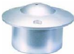
CC-UFO4108: Color Ceiling Camera, 1.5 Lux, 380 TV Lines, Cone Type, 3.6mm