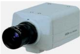
CC-2104A-K: Color professional camera, 1.0 Lux, 380 TV Lines, 4mm Bracket, 60 ft. Cable, Adapter