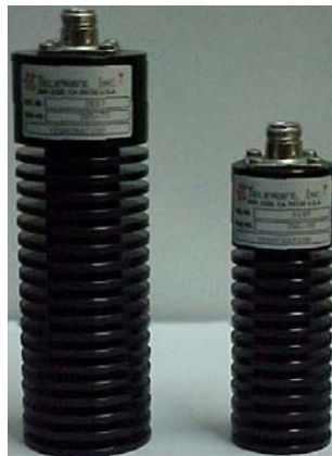
TWL-50: Coaxial Dummy Load Frequency Range: 0 - 3000 MHz Connectors: N or UHF Power: 50 Watts

TWL-75: Coaxial Dummy Load Frequency Range: 0 - 3000 MHz Connectors: N or UHF Power: 75 Watts