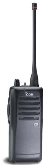
IC-F21S - 2 channels version