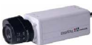
CC-7131AIA: Professional, 1/3" CCD, Metal, 0.1 Lux, 380 TV Lines, Audio, DC / Video Iris, Mirror