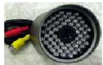
BCN-4060 B/W Night Vision up 100ft , 60 x LED, 0.001 Lux, 400 TV Lines, 3.6mm