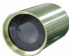
CW-0160W-K: Bullet, Weatherproof, Brass, 1.5 Lux, 380 TV Lines, 3.6mm Bracket, 100 ft. Cable, Adapter