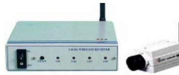
CW-244S-K: 500 ft. Transmission 2.4 Ghz. Wireless Color Camera DC 15V. High Power Dipole Antenna with Audio + 4 Ch. Switcher Receiver 2 x Adapter + RCA Cable kit