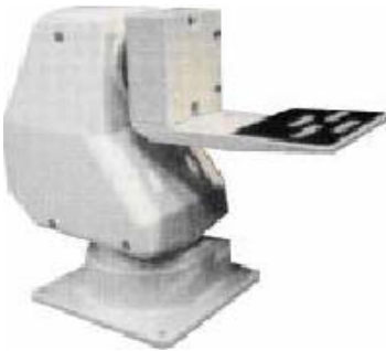
PTI-110/PTI-24: Pan/Tilt, angle:0-340, Tilt:+75~-75 13 lbs, 110V/24V. AC