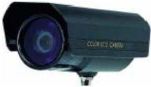
BC-4019W/H-K: B/W Night Vision Camera, 6 x IR-LED, Up to 15 ft., 0.01 Lux, 400 TV Lines, Bracket, 60 ft. Cable, Adapter