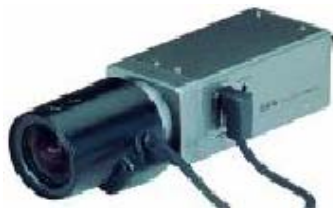
BCN-2006XAI: B/W Night Vision Camera, 0.003 Lux, 400 TV Lines, Audio