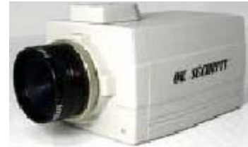
CO-2360 Color Obs. Camera, 1.5 lux, 380 TV lines, 4mm.