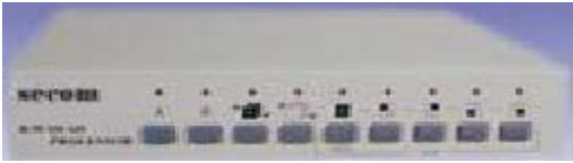
BQ-800: B/W 8ch. Quad Splitter BNC - RCA