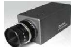
BC-4004A: B/W Pro. Camera, 0.1 lux, 400 TV lines, Autoiris Electronic