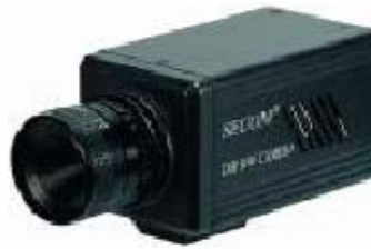
BO-2460: B/W Obs. Camera, 0.1 lux, 400 TV lines, 4mm., Metal Case