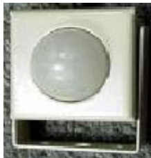
SM-32: Color Obs. Camera, Motion Sensor, Focus: 12mm., angle:100'