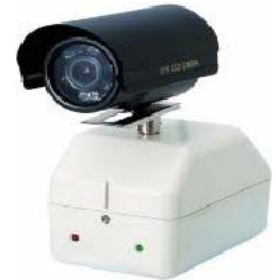
PAN-10: Miniature Auto & Manual Pan With Controller