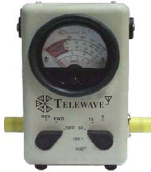
Model 44A: Broadband Wattmeter 25 MHz to 1000 MHz

TWL-75: Coaxial Dummy Load Frequency Range: 0 - 3000 MHz Connectors: N or UHF Power: 75 Watts