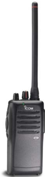
IC-F21 - UHF handheld radio