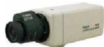
CC-H3624, 2146AIL, H7146: 1/3" Sony Color High Resolution Camera, 1.0 Lux, 480 TV Lines, AC 24V. Line Lock,