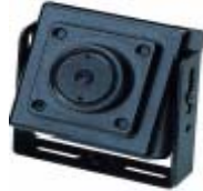
CC-4130PHA-K Color Mini Camera, 1.5 Lux, 380 TV Lines, 3.7mm, Audio Bracket, 60 ft. Cable, Adapter