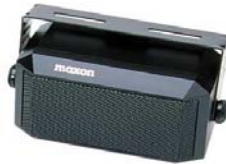
AA-1470 Remote speaker