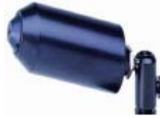
BC-2002PH-K B/W Bullet Camera, 0.4 Lux, 400 TV Lines, 3.7mm Bracket, 60 ft. Cable, Adapter