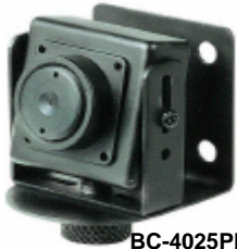
BC-4025PHA-K B/W Micro Camera, 0.4 Lux, 400 TV Lines, 25 x 25mm, Audio Bracket, 60 ft. Cable, Adapter