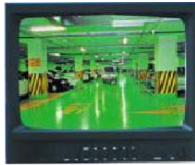
CM-144SD 14" Color Monitor 4 CH. Switcher, 2 Way Audio, 380 TV Lines, 4 x BNC, Multi System