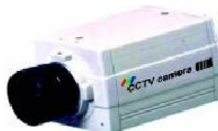
CC-7141A: Professional, Metal, 1.5 Lux, Audio 4mm Lens, Bracket