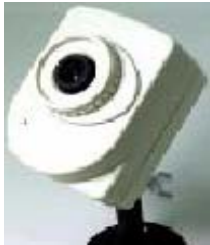
BO-2160 B/W Obs. Camera, 1/3" CCD, 0.1 lux, 400 TV lines.