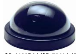
CD-2103D3A/CD-7241A-K: Color Dome camera, 1.5 Lux, 380 TV Lines, 3.6mm 60 ft. Cable, Adapter