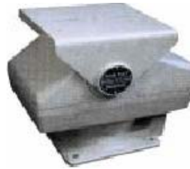
PTO-110/PTI-24: Pan/Tilt, angle:0-355, Tilt:-60~+30 45 lbs, 110V/24V. AC