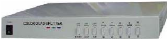
CQ-8060: Color 8ch. Quad Splitter, Real Time, BNC-RCA