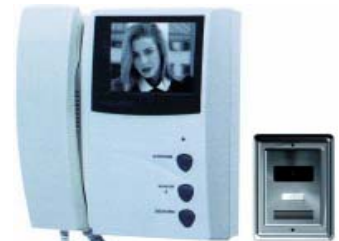
VDP-2460F-K: Video Door Phone 1 Camera - 4 Monitor, 2 Wires, 6 x LED, 90 - 260 V. AC., Weatherproof