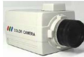
CC-1360A-K: Color professional camera, 1.5 Lux, 380 TV Lines, 4mm Bracket, 60 ft. Cable, Adapter