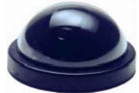
BD-2003D1A/4001-K 1/3" B/W Dome, 3.6 mm. 0.1 Lux, 400 TV Lines 60 ft. Cable, Adapter