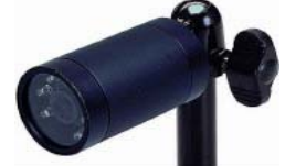
CC-2120W-K: Under water, Brass, 1/4" color, 3.6 mm., 1.5 Lux, 380 TV Lines, Bracket, 60 ft. Cable, Adapter