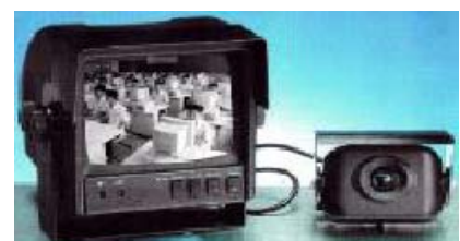
JR-205S: Car rear vision, 5.5", 380 TV lines, 0.4 lux, waterproof