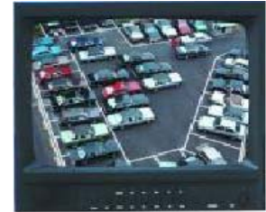
CM-H142 14" Color Monitor, 460 TV Lines