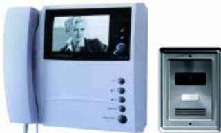
VDP-2240F-K: Video Door Phone 1 Camera - 1 Monitor with 40 Memories: 40 Visitors Pictures with Date & Time OSD, 2 Wires