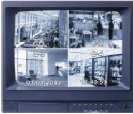
BM-124QR: B/w 12" monitor, Real time Quad Remote controller