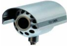
BC-4039WAH-K B/W Night Vision Camera, 12 x IR-LED, Up to 50 ft., 0.01 Lux, Bracket, 60 ft. Cable, Adapter