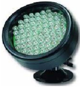
IR-68/45: Illuminator: Night vision 68 & 45 x led 100ft in total darkness