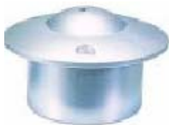
BC-UFO4008: B/W Ceiling Camera, 0.1 Lux, 400 TV Lines, Cone Type