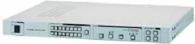
MUX-1600D (BON) / (TII): 16ch. Color Digital Multiplexer, Full Duplex