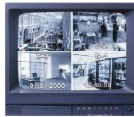
BM-174Q 17" MONITOR WITH 4CH. QUAD