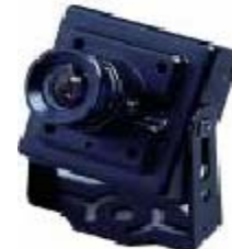
BCN-2005X: B/W Mini Night Vision Camera, 0.005 Lux, 400 TV Lines, 25 x 25mm.